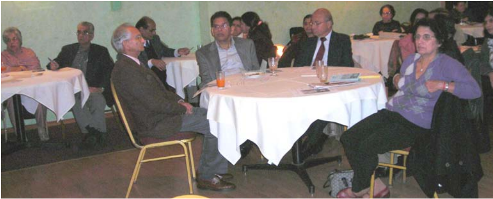
One section of audience at the IALI Senior Luncheon