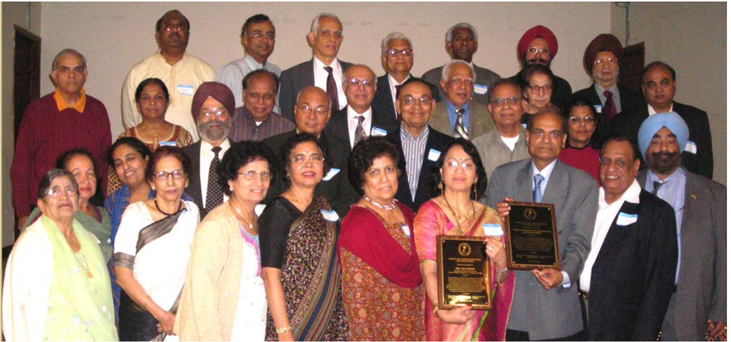
Some of the sponsors, collaborators, honorees and participants