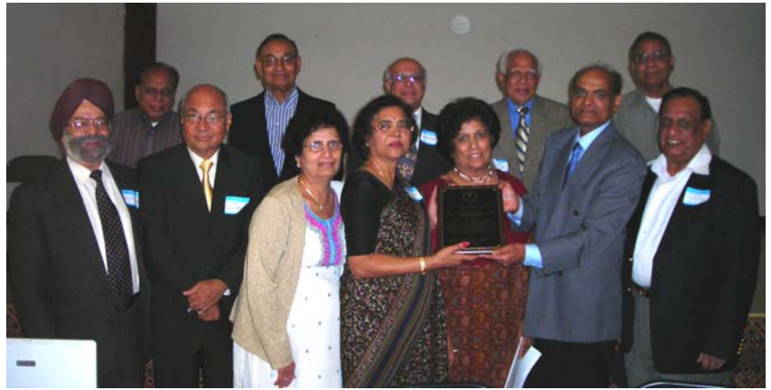
IALI being honored: JCA & NIAASC officers join IALI Senior Citizen Committee & IALI President